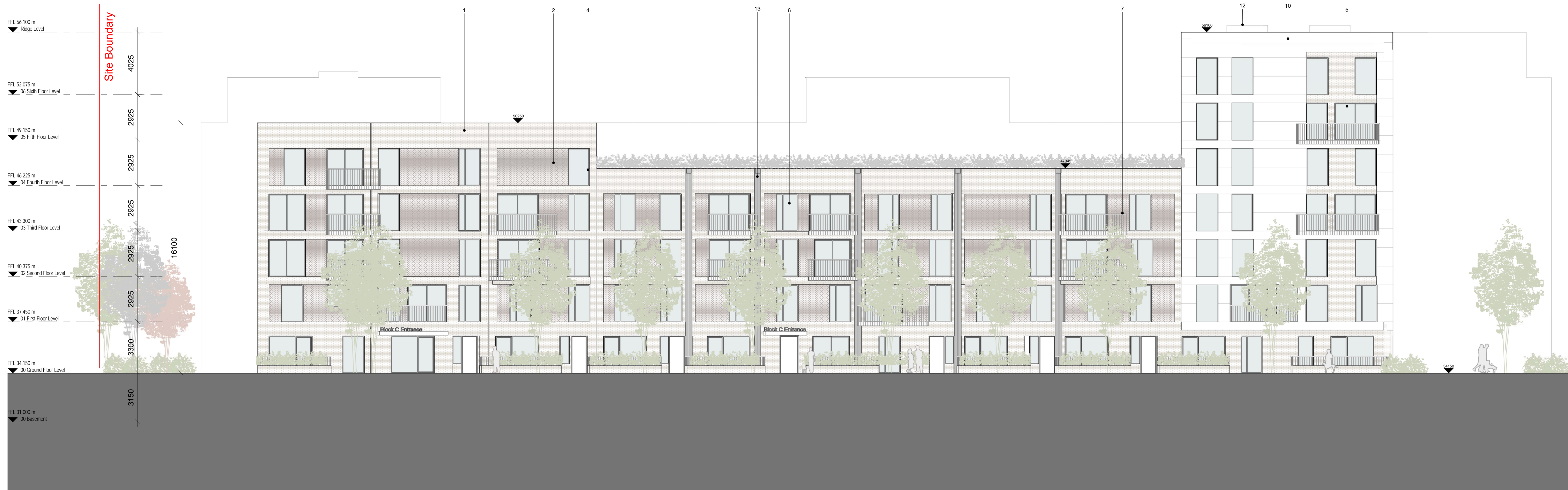
1 Elevation SE 1 : 100